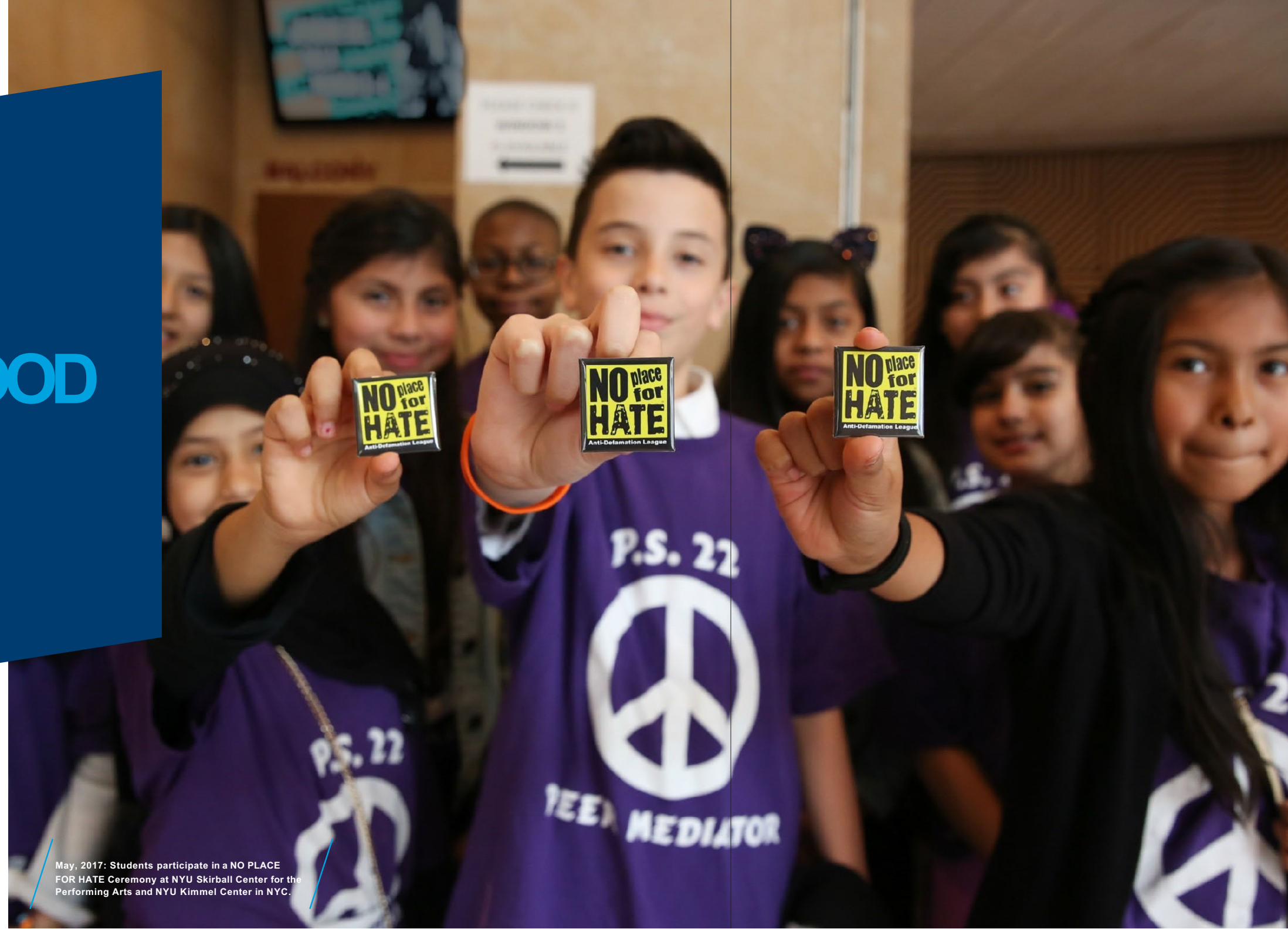
May, 2017: Students participate in a NO PLACE FOR HATE Ceremony at NYU Skirball Center for the Performing Arts and NYU Kimmel Center in NYC.