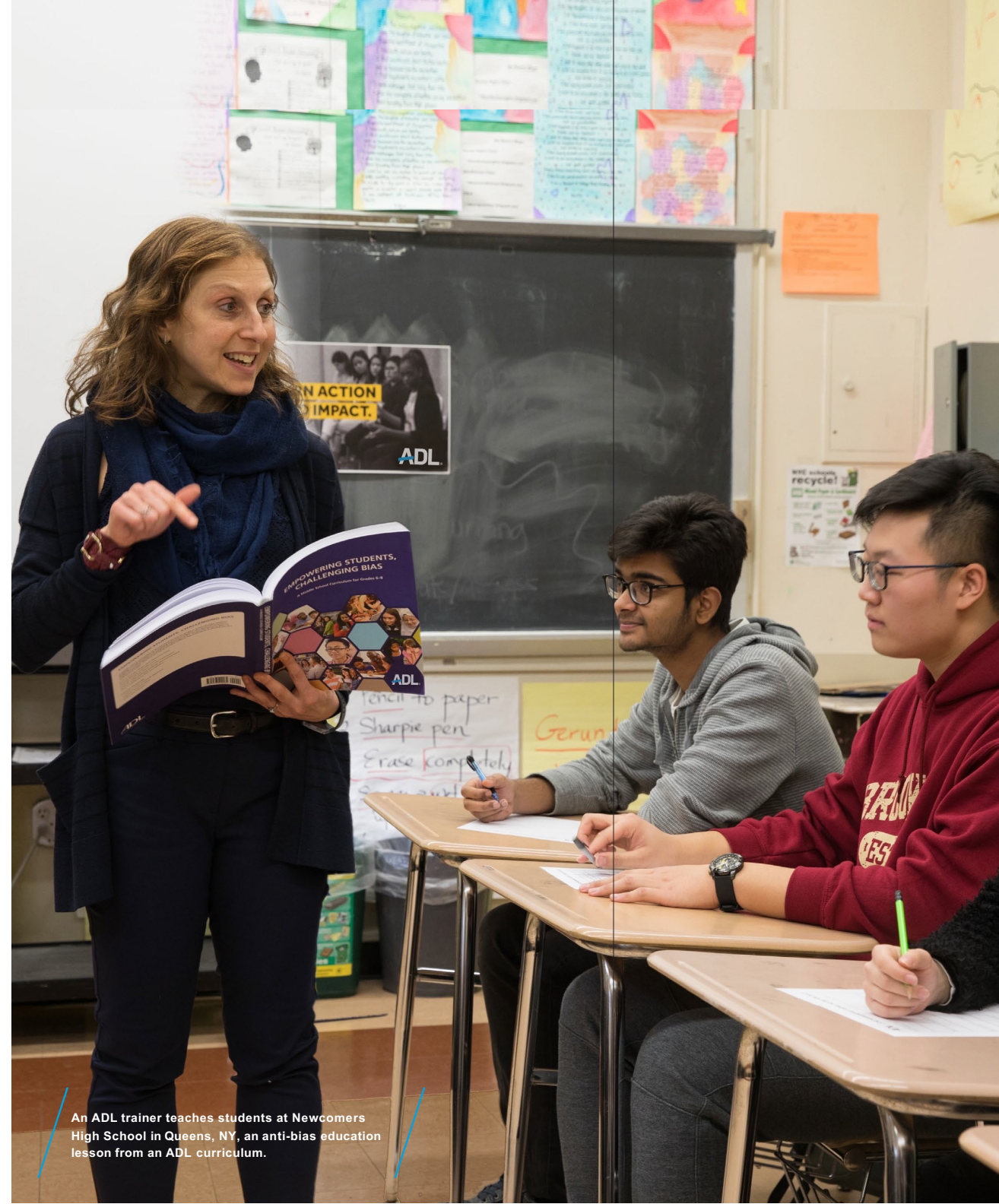
An ADL trainer teaches students at Newcomers High School in Queens, NY, an anti-bias education lesson from an ADL curriculum.

Never has it been more important to defend democratic ideals, and ADL stands at the ready to leverage our moral authority in standing up for anyone targeted by unjust laws and policies.