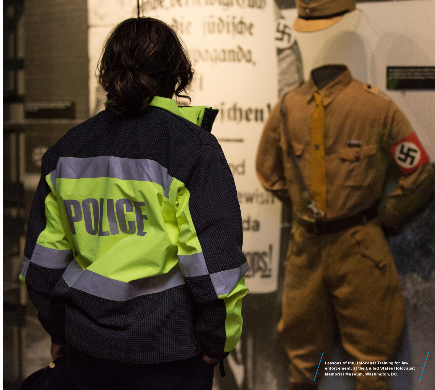
Lessons of the Holocaust Training for law enforcement, at the United States Holocaust Memorial Museum, Washington, DC.

Four issue-specific Centers will serve as our means to fight hate for good. Through these four Centers, ADL will strike out antisemitism, extremism, cyberhate and bigotry .